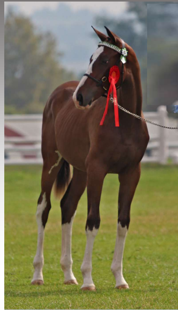
Mythos Del Seya SAW by Mythos Dionysus out of Eagles Lapdancer by Lassiter

Canter: Pushing well from behind, using hocks with an energetic, long, and elastic stride. Good freedom of the shoulder and good rhythm in the pace, uphill in the front.