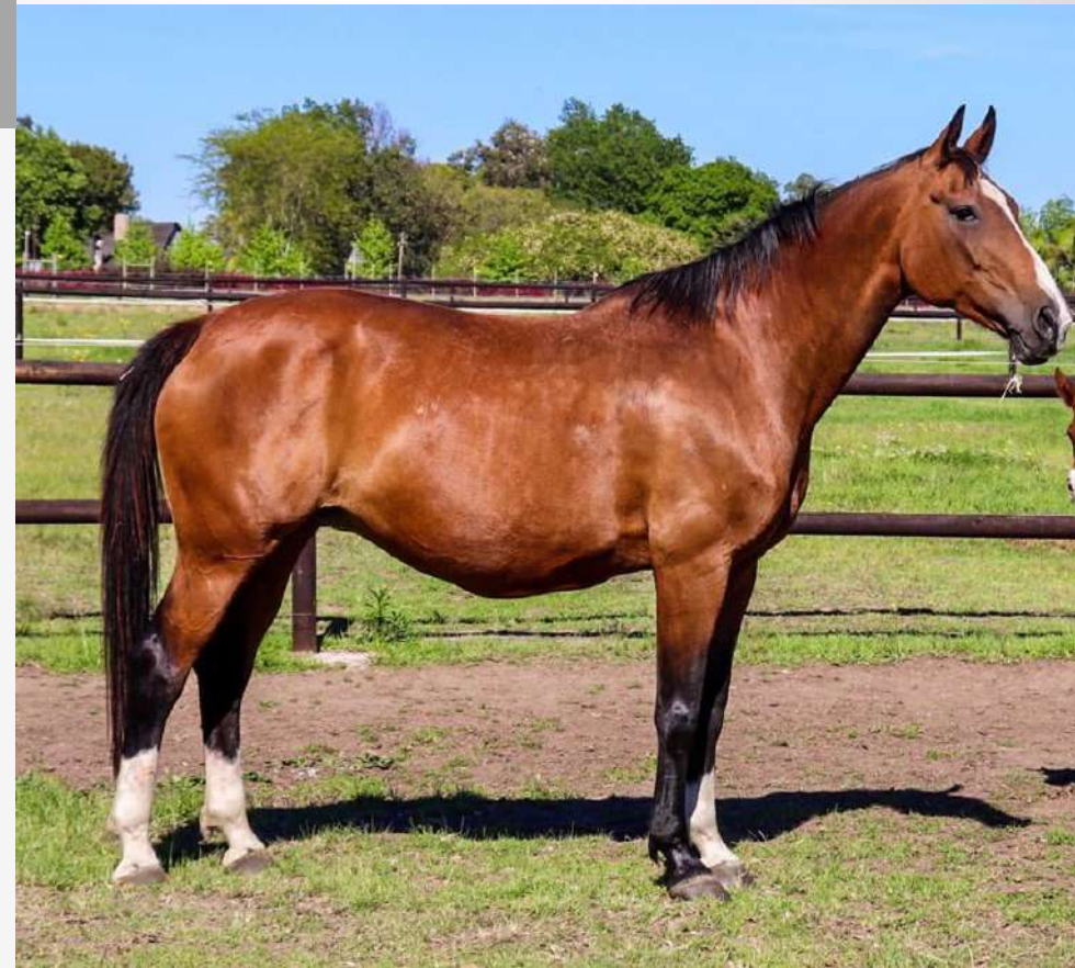
Alzu ON AIR SAW (Optimum vd Wellington / Carrick/ Landjunker I) owned by Moorcroft Stud. Jumper open, now broodmare

www.sporhorse-data.com with photos where available.