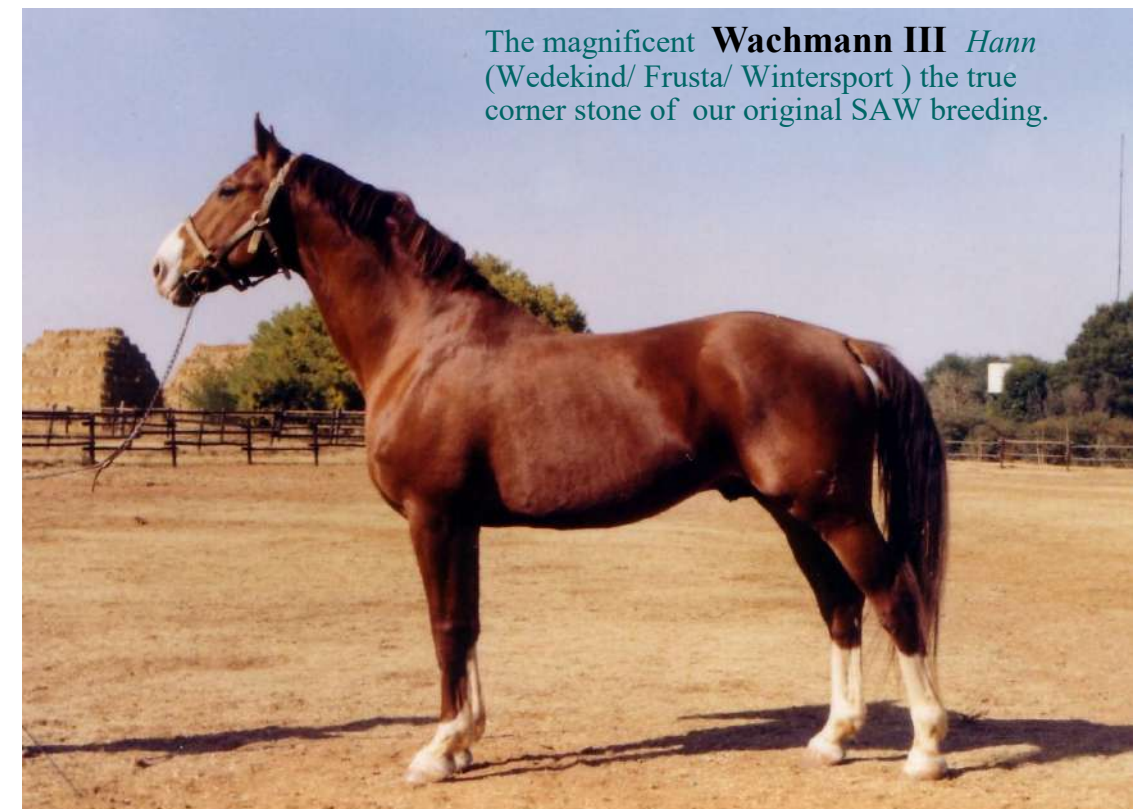
The magnificent Wachmann III Hann (Wedekind/ Frustra/ Wintersport ) the true corner stone of our original SAW breeding.